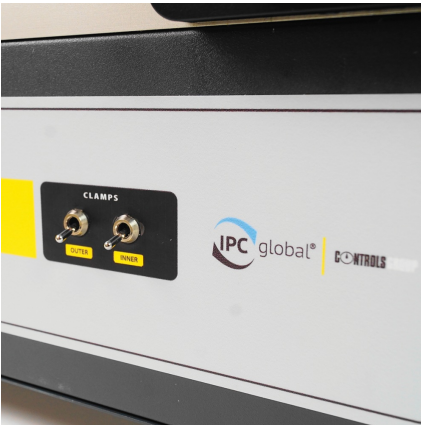
Detail of Servo-Pneumatic Four Point Bend Apparatus